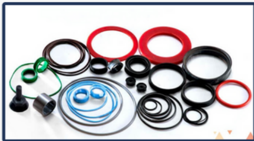
Silicone Rubber Products

Each product is crafted with precision to meet the highest industry standards, providing reliable solutions for diverse industrial applications.